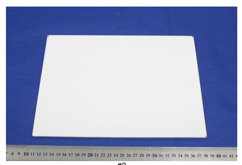
SGS authenticate the photo on original report only *** End of Report***